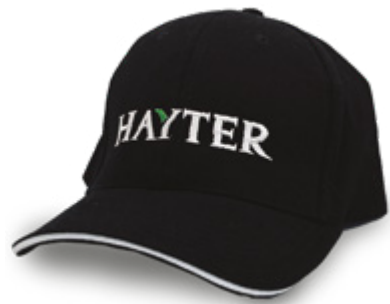
SANDWICH TRIM BASEBALL CAP