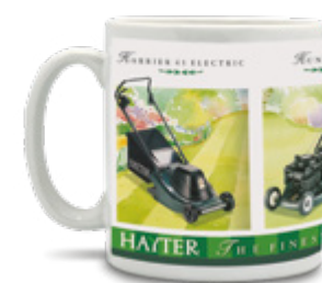
1990'S ERA" MUG