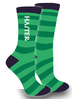
HAYTER STRIPE SOCKS