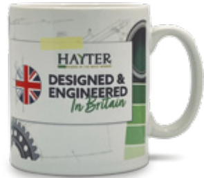
DESIGNED & ENGINEERED IN BRITAIN" MUG