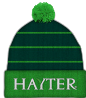
KNITTED BOBBLE HAT