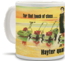
1980'S ERA MUG