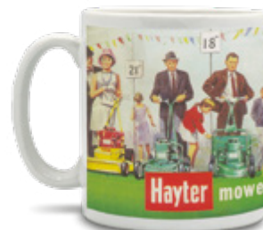
1970'S ERA MUG